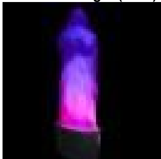
RGB Flame Light (1.5M):